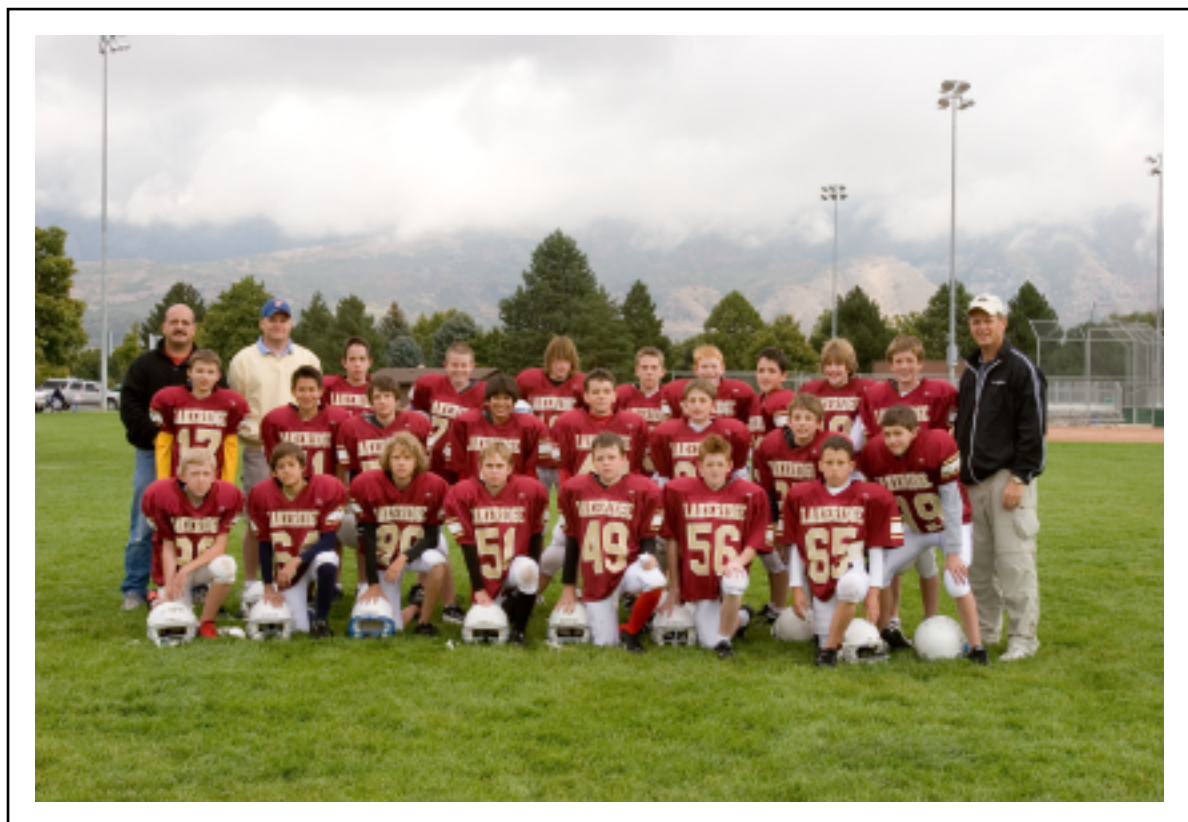
“NORMAL” Team photo (Code T-1)