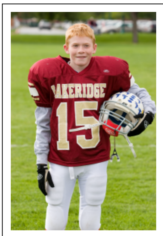
Helmet under arm Ind. photo (Code I-1)