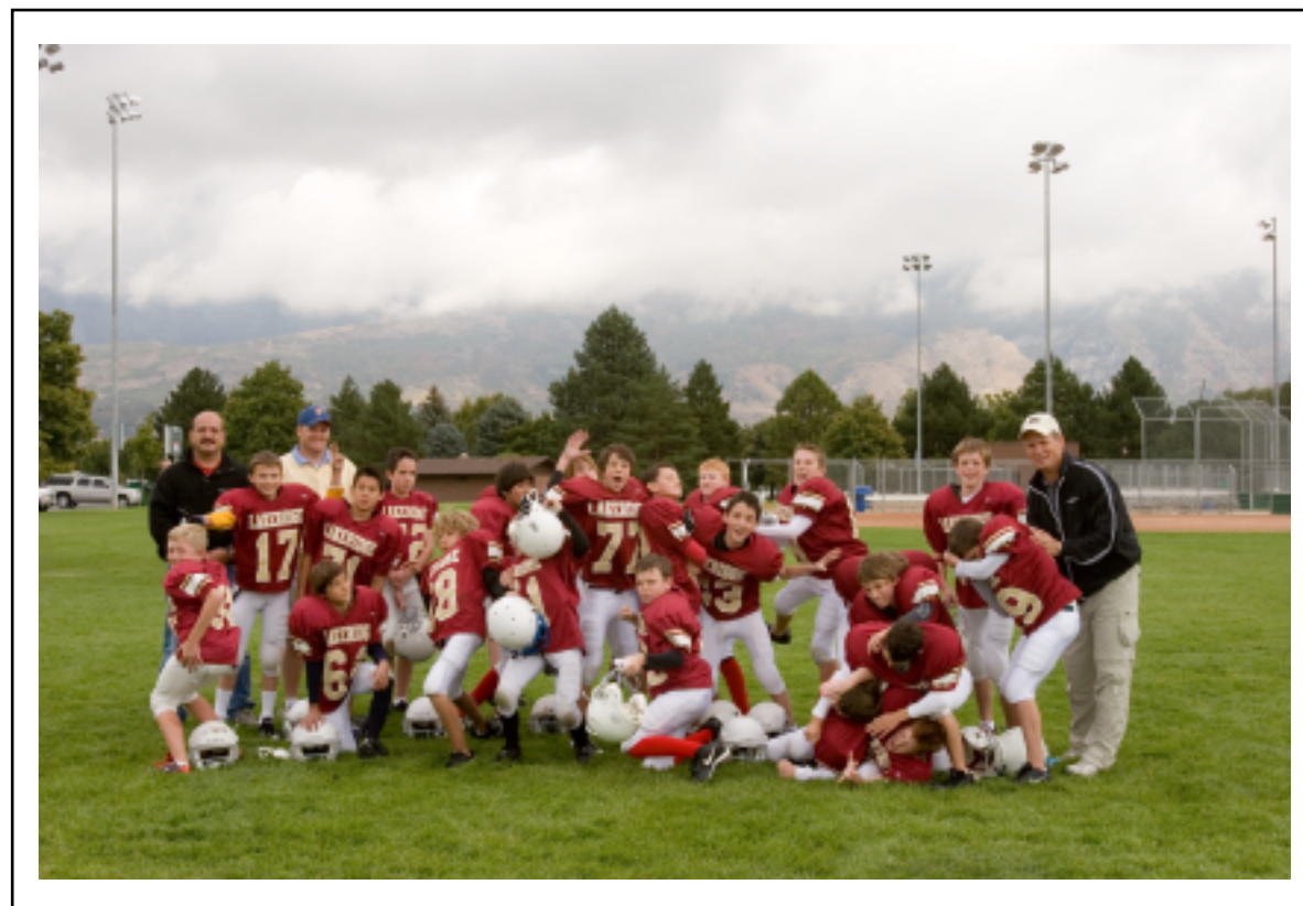
“FUN” Team photo (Code T-2)