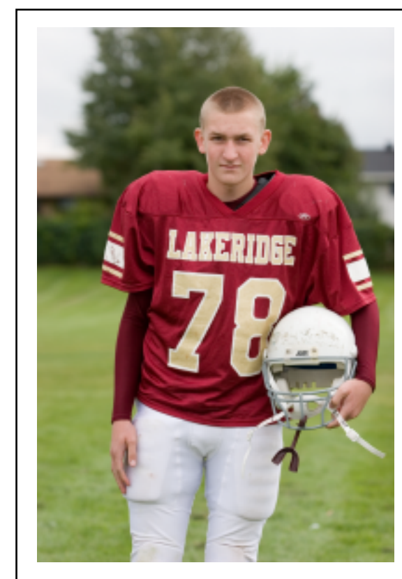
Serious Looking Ind. photo (Code I-3)